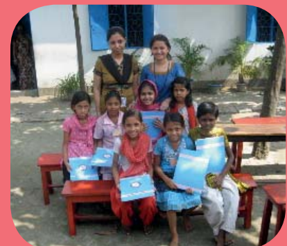
CHILDREN AT SCHOOL OF HOPE DURING IUBAT SUPPORTED HEALTH CHECK-UPS.

Afterwards she received this note from the school's head: "Thanks to you we were able to save a child's eyesight! One of the girls at the School of Hope was discovered to have an eye disorder as a result of the medical check up. [We] arranged for her to visit the Institute of Ophthalmology, where she was found to have a rare 1 in 100,000 disease. With two courses of antibiotics the disease was treated. [Untreated] her eyesight would have deteriorated rapidly, and she may have lost her sight."