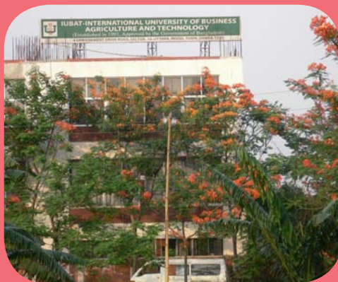
ADDITIONAL STOREY ON THE IUBAT BUILDING, SURROUNDED BY BLOSSOMING KRISHNACHURA TREES.